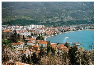
A view on Ohrid