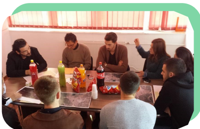
Mapping of the facilities, Peja

The idea of this activity was to assemble the young people from the local community together, and discuss with them on the possible development of their towns, which they, who represent the future of our communities, must have a say in. Young people of the communities of the partner organizations were encouraged to use their creativity and expressiveness to come up with possible improvements that can be done in their respective towns.