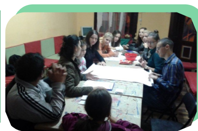
Mapping of the facilities , Knjazevac

The activity “My City - Youth City” was held within the framework of the Balkan regional platform for youth participation and dialogue. The activity was held during different time periods in different months by our eight partner organizations, the local democracy agencies in different towns.