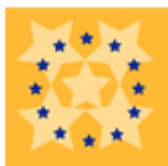
Local democracy Agency Niš