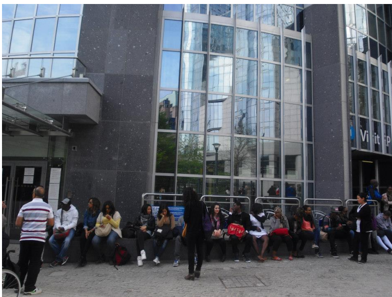
Members of the Municipal Council of Youth in front of the European Parliament in Brussels on May 7, 2013